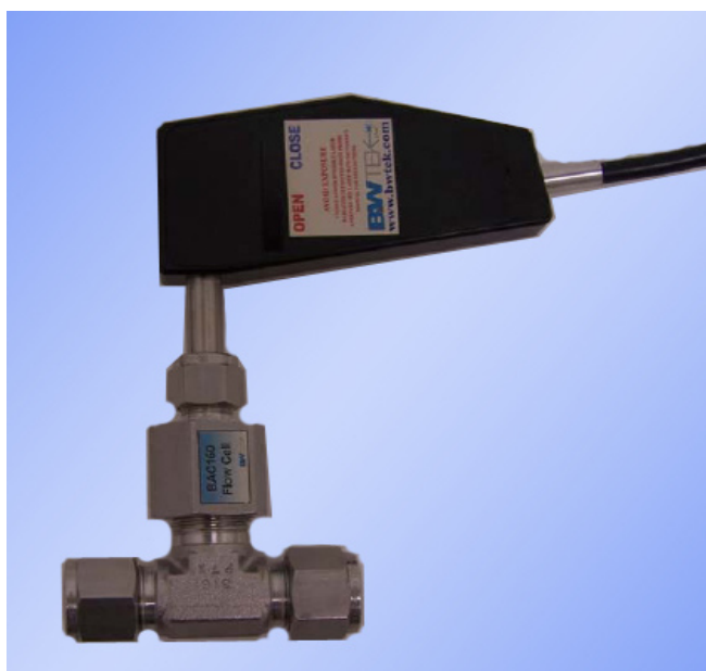
Flow Cell with B&W Tek Raman Probe